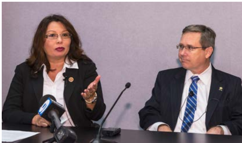
U.S. Rep. Tammy Duckworth (D-Ill.) and U.S. Sen. Mark Kirk (R-Ill.) address the audience at a national conference hosted in September by John Marshall's Veterans Legal Support Center & Clinic. The conference was made possible thanks to a generous grant from the American College of Trial Lawyers.

Along the way, he's been guided by analytical and strategic skills he attributes in part to his law degree. "My degree, and the rigors of analysis that we go through in law school, are absolutely, positively applicable to business," he said.