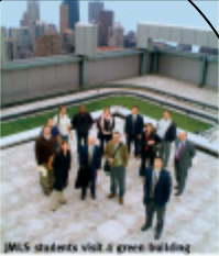
JMLS students visit a green building

■ In response to the push to go green, John Marshall Law School in Chicago launched a new certificate in sustainability law. Offered through its center for real estate law, the new program allows J.D. students to center their sights on the hot topic of sustainability and its increasing importance in real estate, transactional and regulatory work.