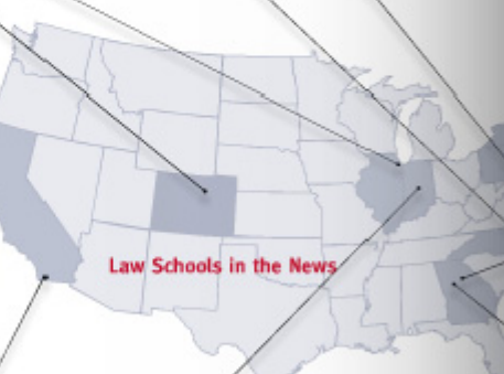
Law Schools in the News

■ Penn State University has started an International Sustainable Development Law Clinic which will give law students the chance to join University colleagues from a wide range of disciplines who are working to develop, design, and implement humanitarian projects and social ventures in the developing world. The school has described the clinic as the “first of its kind.” Law students will work with students in other disciplines to “develop technology-based solutions to compelling problems facing developing countries, and transform these solutions into sustainable and scalable ventures that enable positive social change.”