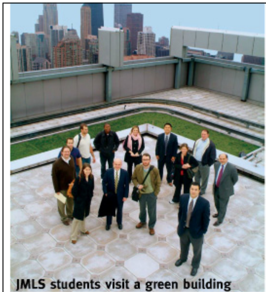
JMLS students visit a green building

■ In response to the push to go green, John Marshall Law School in Chicago launched a new certificate in sustainability law. Offered through its center for real estate law, the new program allows J.D. students to center their sights on the hot topic of sustainability and its increasing importance in real estate, transactional and regulatory work.